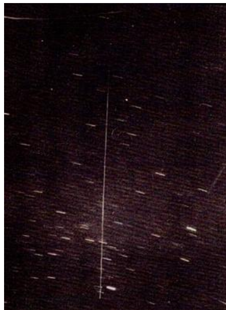
Time exposure shows vertical path of Pegasus Polar satellite being crossed by arcing, but faint, path of UFO in upper left to upper center.

Others throughout Prescott called in the Courier desk on Friday night to report seeing UFOs “zigzagging through the air” and “executing incredible maneuvers.” This flood of calls inspired Courier staff photographer Chuck Roberts to step onto the roof of the newspaper office building to see if he could capture a photo of at least one of the UFOs. Not seeing anything unusual at first glance, other than some star-like lights moving across the heavens at an extremely high altitude, he set up his camera to take a five-minute time exposure of the sky for subsequent analysis.