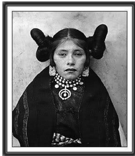
Traditional Hopi maiden with butterfly hairdo.

depicting a Hopi maiden with a traditional butterfly hairdo being carried in a wingless, dome-shaped vessel. The arrival of this maiden,” he assured us, “signified the Day of Purification. At that time, all of the Hopi who wanted to go with her would be flown to Venus and other planets on ‘ships without wings.’ These are sky canoes similar to the one that brought the Great Maasau here in the first instance. The Great Maasau told us that all other worlds are inhabited and that not only are the prayers of the Hopi received by him and other chiefs of the Star People on these other worlds, but that following the Day of Purification, any of the Hopi who wanted to live on these other planets would certainly be most welcomed.”